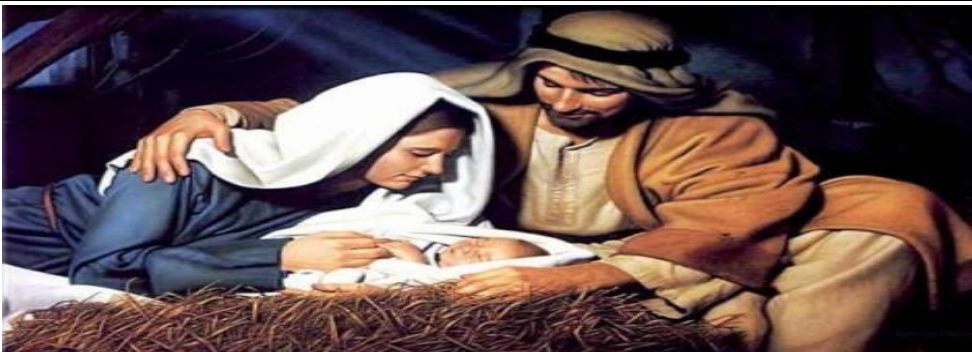
FOURTH SUNDAY OF ADVENT DECEMBER 23, 2018

LITURGICAL REFLECTION... The Word has become flesh and dwells among us. This Christmas Day Christians celebrate the mystery of the eternal Word of God becoming one like us in all things but sin. The Eternal Word lived on this earth, to reveal to us the great love of God. God who has no beginning or end has arrived as an infant in a manger. We are filled with awe as we attempt to understand the mystery of this birth. Angels and shepherds sing Christmas praise. We join in singing- Glory to God in the highest and peace to people of good will!