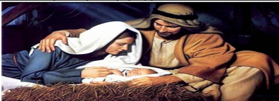
FIFTEENTH SUNDAY IN ORDINARY TIME JULY 13, 2025

LITURGICAL REFLECTION... The Word has become flesh and dwells among us. This Christmas Day Christians celebrate the mystery of the eternal Word of God becoming one like us in all things but sin. The Eternal Word lived on this earth, to reveal to us the great love of God. God who has no beginning or end has arrived as an infant in a manger. We are filled with awe as we attempt to understand the mystery of this birth. Angels and shepherds sing Christmas praise. We join in singing- Glory to God in the highest and peace to people of good will!