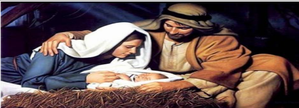
THE EXALTATION OF THE HOLY CROSS SEPTEMBER 14, 2025

LITURGICAL REFLECTION... The Word has become flesh and dwells among us. This Christmas Day Christians celebrate the mystery of the eternal Word of God becoming one like us in all things but sin. The Eternal Word lived on this earth, to reveal to us the great love of God. God who has no beginning or end has arrived as an infant in a manger. We are filled with awe as we attempt to understand the mystery of this birth. Angels and shepherds sing Christmas praise. We join in singing- Glory to God in the highest and peace to people of good will!